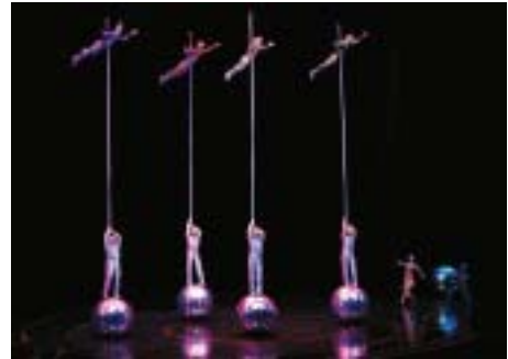
Bright lights: (clockwise from left) The Venetian Macao Misty greens: The participants putting on the practice greens Balancing act: Acrobats performing at the ZAIA show—the first permanent show in Asia A taste of Italy: The Gondola ride in Grand Canal Shoppe—the shopping complex in The Venetian at the 3rd floor

boasts a capacity for some 50,000 people and 5,000 exhibitions booths.